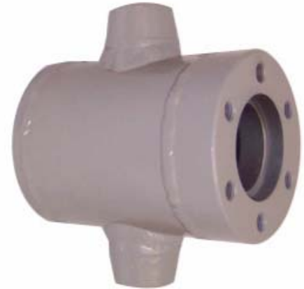
C303CS - 3 model shown